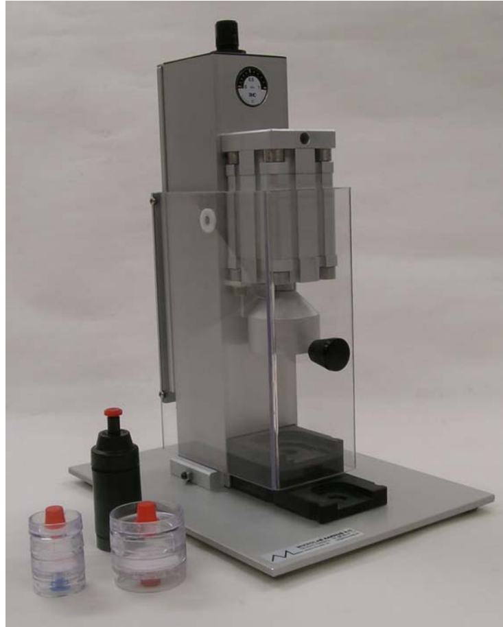
ML 303850 Filter Assembler, pneumatic

The apparatus is universal and can be used with all three common types of filter cassettes, 25 and 37 mm.